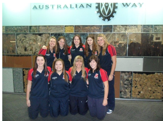
Greenwood SHS team at the 2010 AVSC

The atmosphere of this competition is incomparable and Volleyball WA always encourage schools to attend as a way for their students to be exposed to a high level volleyball competition and to put their teams up against the best in Australia. This year we had over 50 school teams from WA representing Rossmoyne SHS, Aquinas College, Greenwood SHS, Wesley College, Santa Maria College and Trinity College with a number of schools declaring their intentions to become involved in 2011.