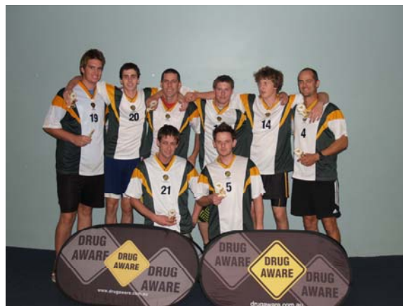
Albany—Men’s A Country Champions