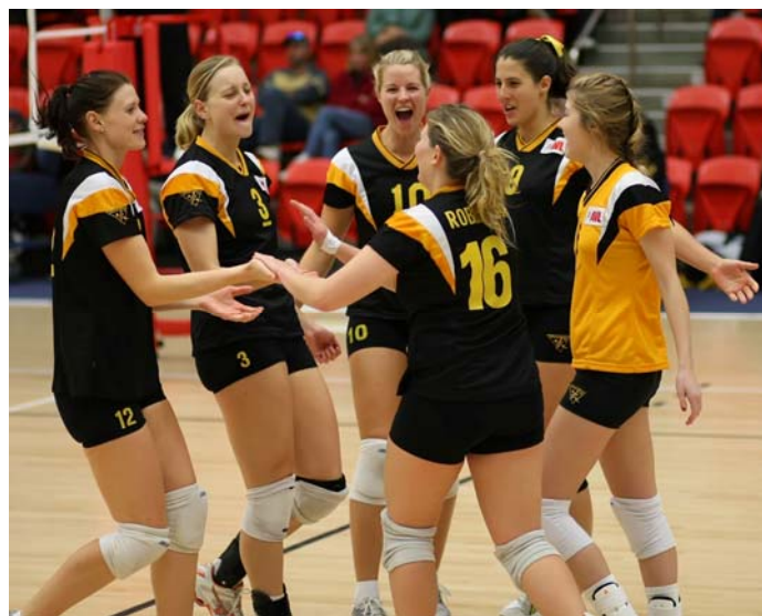
WA Pearls celebrating during the Perth Round