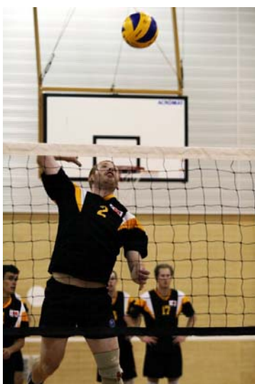
WA Hornets at training