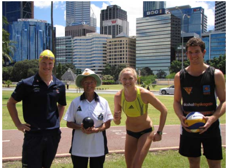
Photo promoting the City of Perth Festival of Sport