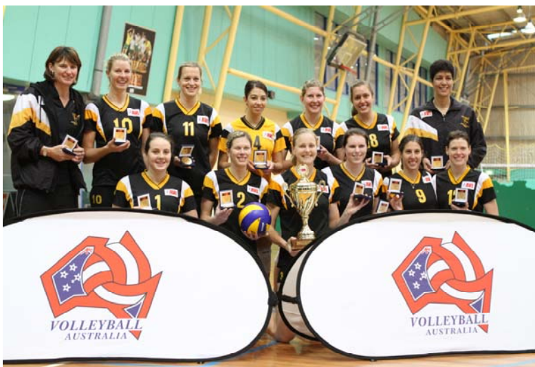
WA Pearls 2010 Gold Medalist Australian Volleyball League