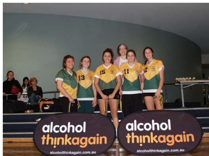
Below: Penrhos College Female Open Honours Runner Up