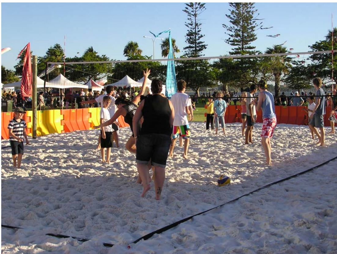
Beach Volleyball Court at the 2011 Australia Day Skyshow—Langley Park

Beach Volleyball continued its growth trend, attracting new teams and retaining the "regulars". Summer and Spring seasons ran at maximum capacity of teams for 2 a side social competition on Monday evenings. Many teams played only for the social aspect and other teams joined the 2 a-side social competition as part of extra training for the State Series season. In the Spring season, the popularity of the 2 a-side competition continued to increase, with a resultant drop in the number of teams nominating for the 4-a-side competitions. The Summer season is the most popular season when it comes to the 4-a-side competitions..