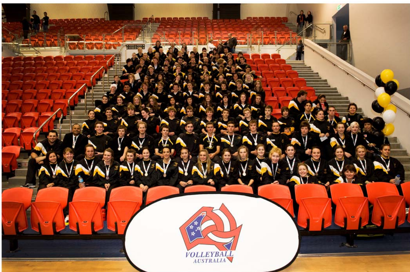
WA's 2010 AJVC Delegation

The WA contingent of referees again delivered a stellar performance, with excellent feedback received from other states and tournament organizers.