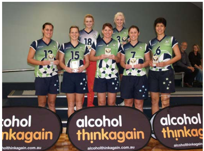
Southern Cross Super League Women Winners PVL 2010