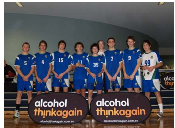
Trinity College Male Open Honours—Runner Up 2010. Alcohol. Think Again WA Volleyball Schools Cup