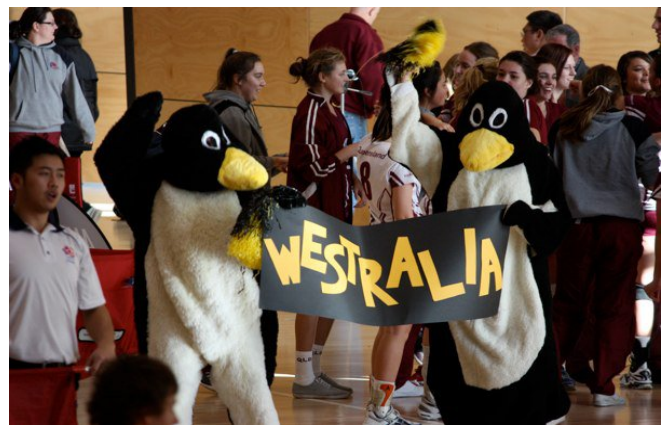
Above: WA’s supporters at the 2010 AJVC