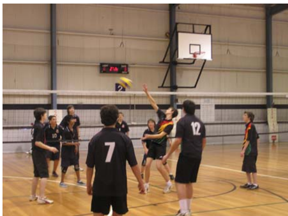
Action from the 2010 High School Indoor Com- petition

Volleyball WA would like to thank all teachers and students for a great start for the new competition and we are looking forward to next year's event.